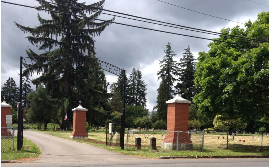
Lee Mission Cemetery 2104 D Street Salem, OR 97301