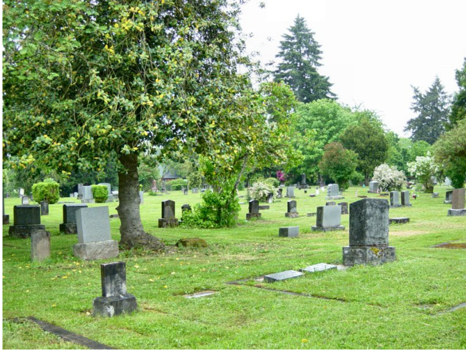
Lee Mission Cemetery PO Box 2011 Salem, OR 97308